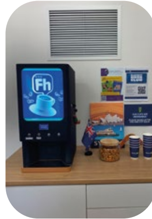
Free coffee and cappuccino